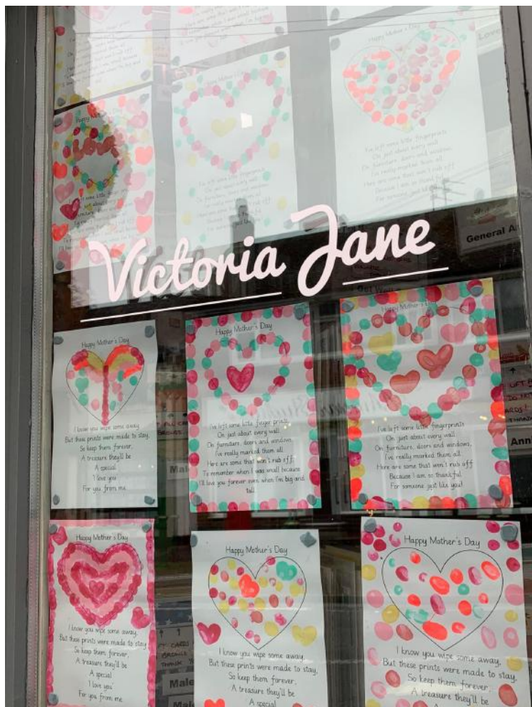
The children have been busy over at the breakfast and after school club creating some beautiful Mother's Day art to display in Victoria Jane in the village.